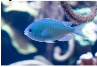
Un poisson bleu.

You can be as wild as you want with your colour choices!