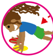
Reverse Formation (Personal)