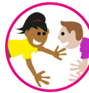
Hand Tap Game (Cognitive)