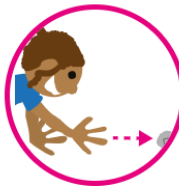
Front Curling (PB Challenge)