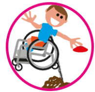
Distance Objects (Creative)