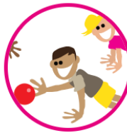
Front Support Hockey (Social)